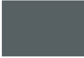
Medium Grey (Stock Color)

All Tennsco Q Line and Bulk Storage Shelving is powder painted with a tough, baked enamel finish to assure years of lasting beauty. Choose from three standard finishes.